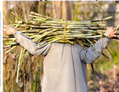
A straw cutting worker