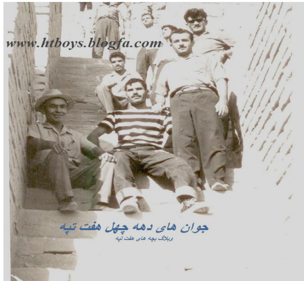
picture of the young workers of the "Haft Tappeh" , the 50 years ago